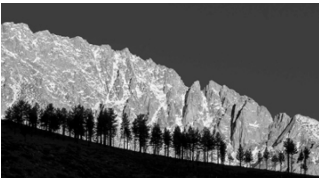
'Trees and Mountains' (near South Lake) by Bob Rice

The gallery walls are located in the Ellie Randol Reading Room during regular library hours.