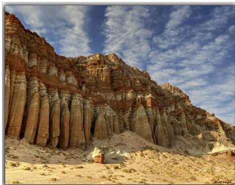
Exhibit runs through September 2022, during library hours. 400 Sierra Park Road, Mammoth Lakes. More Info: 760.934.4777

All photographs are for sale, with a portion of the sale benefitting the Mammoth Lakes Branch Library.