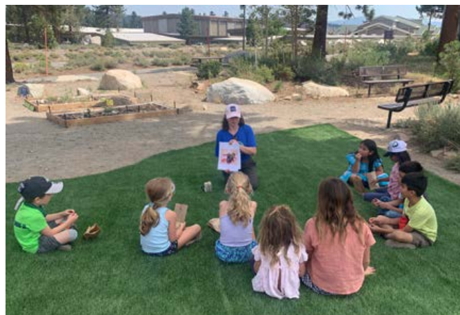
The MakerSpace Pollinator Garden Workshop