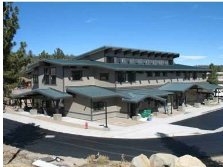
Mammoth Lakes Library from up the hill at the Mono County Office of Education parking lot

We'll start up the book club again next June. Please keep track of the books that you read until then and submit those you enjoyed as book club candidates through our email: mlfol@monocoe.org .