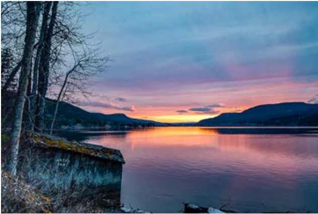
'Perfect Spring Sunset' (lake in BC) by Jennifer Majeski

Additionally, the photographers will have a special sale day for additional framed and unframed prints on Saturday, September 10 th , 12:00 – 4:00 PM.