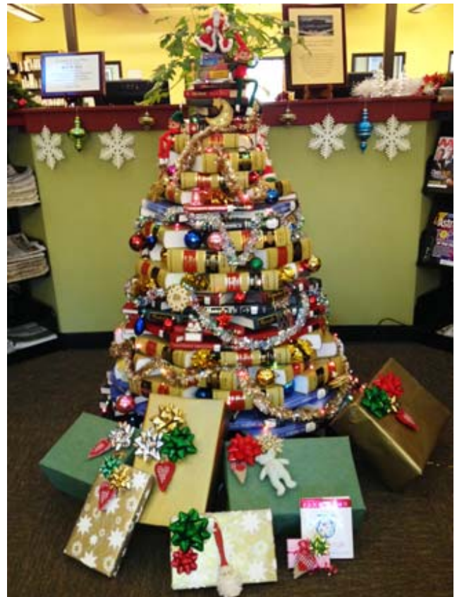
The library's book Christmas "tree"

"I will honor Christmas in my heart, and try to keep it all the year." - Charles Dickens