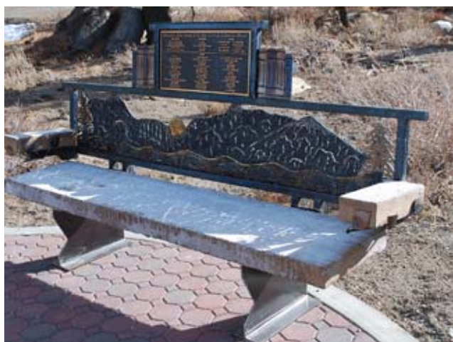
One of the Donors' Benches

time. It is designed to be just the right size for an adult and child to sit together and read a book.