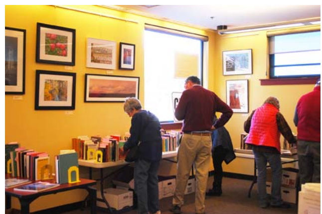
Andrea Mead Lawrence book sale patrons