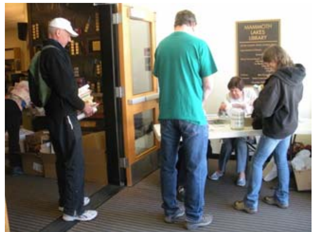
Book patrons at MLFOL book sale